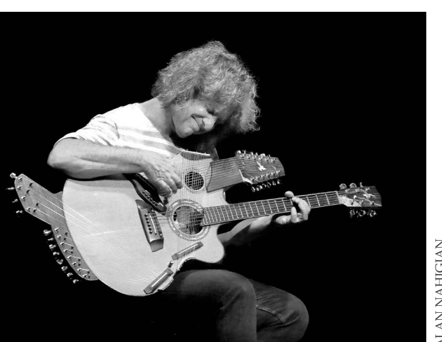
Pat Metheny @ Sony Hall